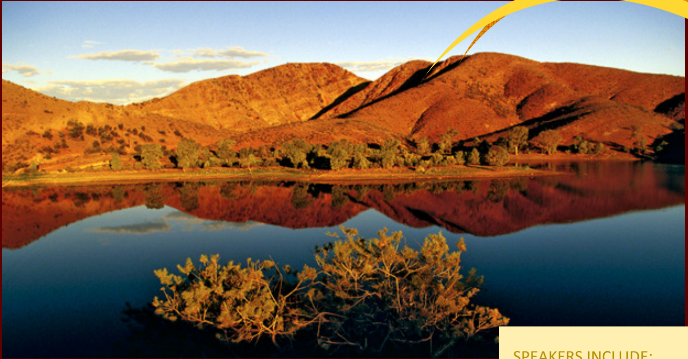
Flinders Ranges

Flinders University City Campus, 182 Victoria Square, Level 1, Room 1 - Adelaide