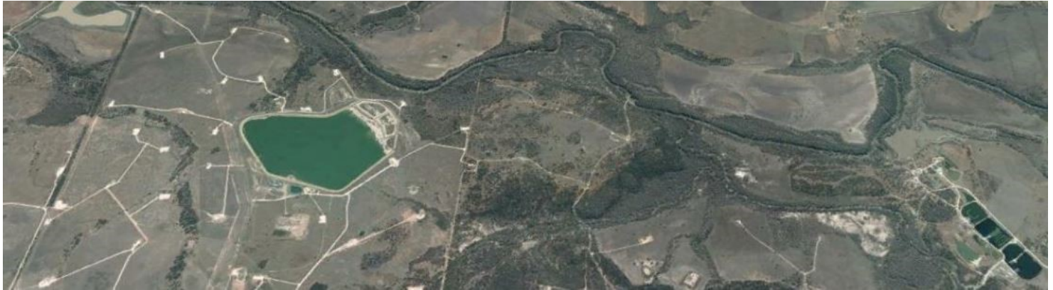
Gasfields and Condamine River.

Banco Court, 415 George Street, Brisbane