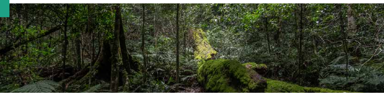
Lamington National Park / Yugambeh Country, QLD.