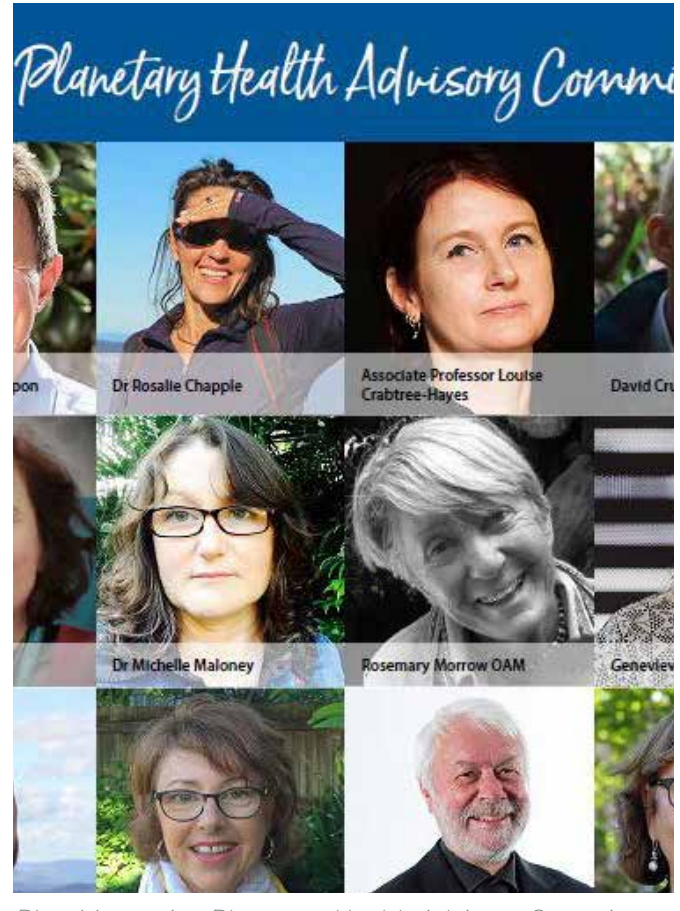
Blue Mountains Planetary Health Advisory Committee members.

After a range of discussions with innovative thinkers within Newcastle City Council, AELA's Earthcentred program and framework, "Greenprints" has been adopted and referenced in the Newcastle City Council's "Local Social Strategy". Greenprints was referenced as "strategy [that] will help our community to thrive while using our resources wisely and not exceeding the capacity of our ecological systems."