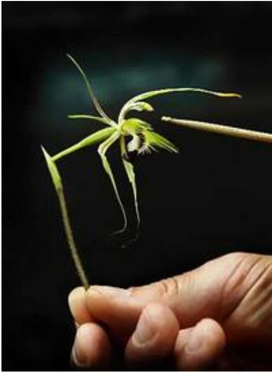
Frankston Spider Orchid